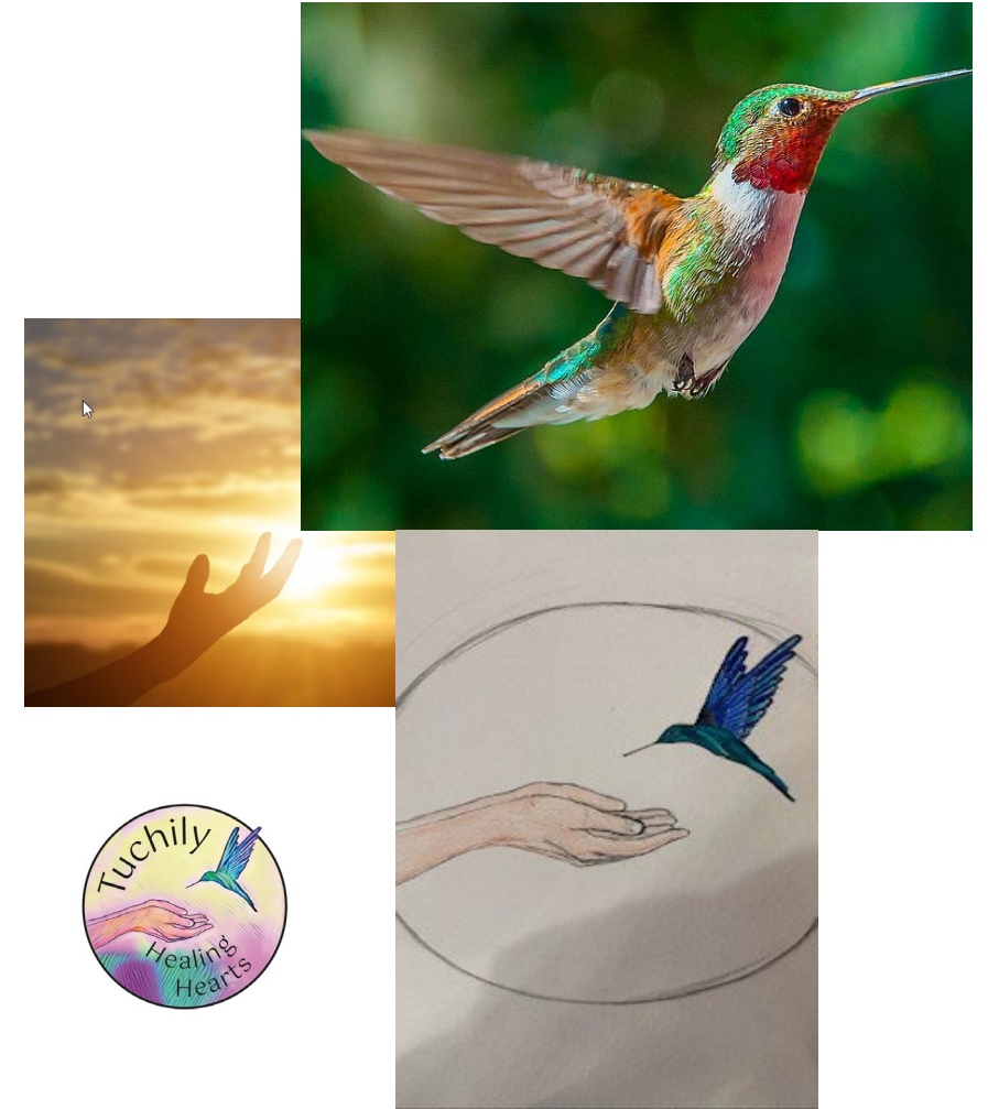
Drawing by a 14 year old Pala Member.